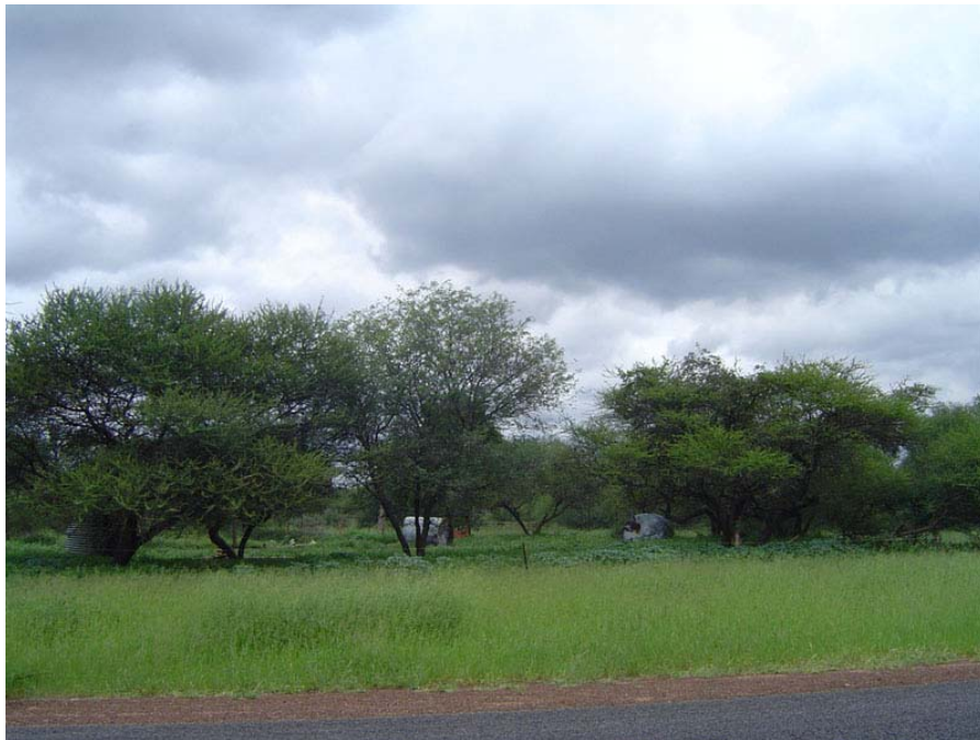
Figure 10.2: The farm Eenzaamheid south of the Steenbokpan Road

The two farms, Naauwontkomen (power station) and Eenzaamheid (ash dump), border the Grootegeluk Coal Mine to the south, along the Steenbokpan Road. The road crosses over both of the properties and will subsequently have to be re-aligned in order to construct the power station and the ash dump. The farms are flanked, to the south and the east, by the railway line transporting coal from the mine. Both of the sites have extensively been utilised as cattle and game farming areas and are characterised by overgrazing and bush clearing patterns. The natural vegetation is, in spite of the former land uses, still relatively intact and will play a large role in the mitigation of the visual impact of the proposed power station and related activities.