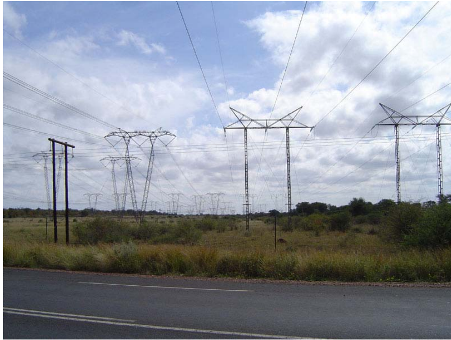
Figure 10.8: Transmission lines spanning the Stockpoort/Steenbokpan intersection.

It is noteworthy that if the northern alignment is selected the proposed transmission lines from Matimba B would more than likely not be visible from any of the roads.