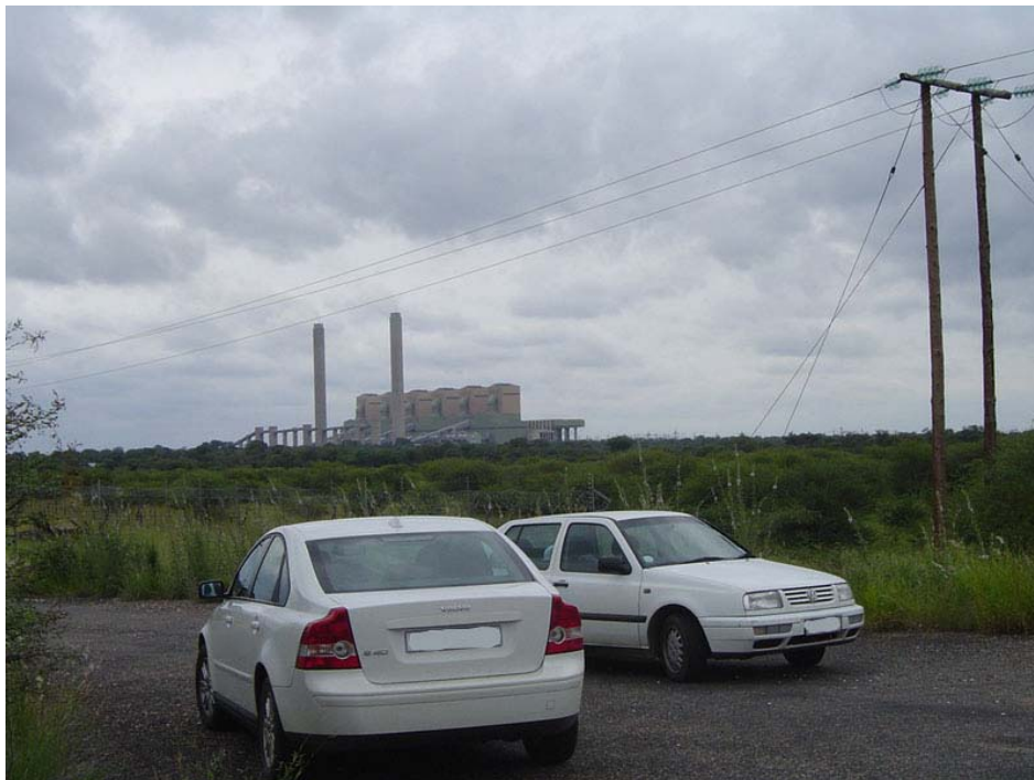
Figure 10.3: View (3.2 km) of the existing Matimba power station from the Steenbokpan road crossing with the ash conveyer belt.

Areas further afield, with similar viewing characteristics, could have the same experience of the proposed facility. The principle of reduced impact over distance would however lessen the likely impact considerably.