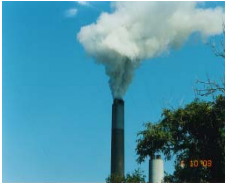
Figure 10.7: An example of a wet plume produced from a wet FGD scrubber

technology has not been decided yet, but some of the technologies being considered would result in a visible plume of harmless vapour being emitted from the smoke stacks. The approximate size of the plume is indicated in Figure 10.7 and it stands to reason that it would more than likely attract attention to the already considerably tall smoke stacks. The severity of the visual impact would depend on the wind direction in relation to the observer. The refraction of light from the minute droplets of water at certain times of the day could worsen the appearance of the plumes. A similar effect, the reflection of the lights of the power station, could create the appearance of an illuminated plume at night. This together with the possible misconception of health threatening emissions being released from the stacks could lead to another potential visual impact.