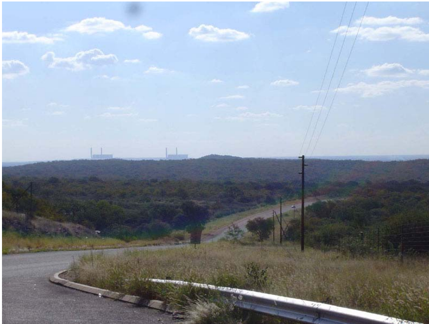
Figure 10.4: Simulated view of Matimba (right) and proposed power stations (left) from a lookout point along the R33, south-east of the study area.

The placement of the proposed power station and its associated infrastructure sufficiently contains the compound visual impact of the proposed facility, the existing power station and the mining activities to a relatively small geographical area without unnecessarily stacking the visual impact. In other words the three major industrial activities in this area do not spread the visual impact over a large area and it does not create a highly noticeable dense cluster of activities. The visual impact is therefore relatively contained and more manageable from a mitigation perspective.