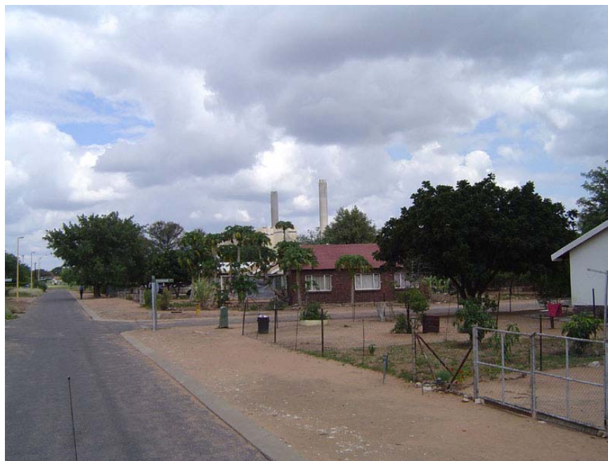
Figure 10.6: View of the Matimba smoke stacks from Marapong. The proposed power station is located 6 km behind the existing power station.

The construction and operation of a coal-fired power station on the farm Naauw ontkomen won't have a significant visual impact on the residents of Lephallale (town), Onverwacht or Marapong. The proposed power station won't be visible from the former two residential areas, mainly due to their distance from the facility and also due to the structures and visual clutter already present in these areas. The Marapong residential area, closest of the three built-up areas, is situated north-east of the existing Matimba power station, and is ironically shielded from the proposed power station by the existing power station (1 - 1.5 km away) and also by its own structures.