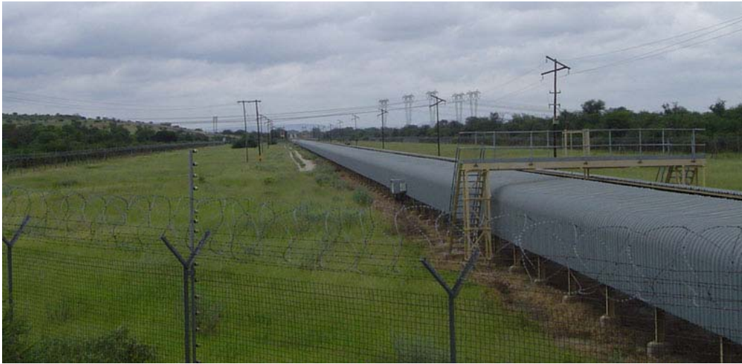
Figure 10.9: Existing Matimba conveyor belt servitude.

The clearing of vegetation for servitudes should be restricted to the bare minimum required for the servicing and maintenance of infrastructure.