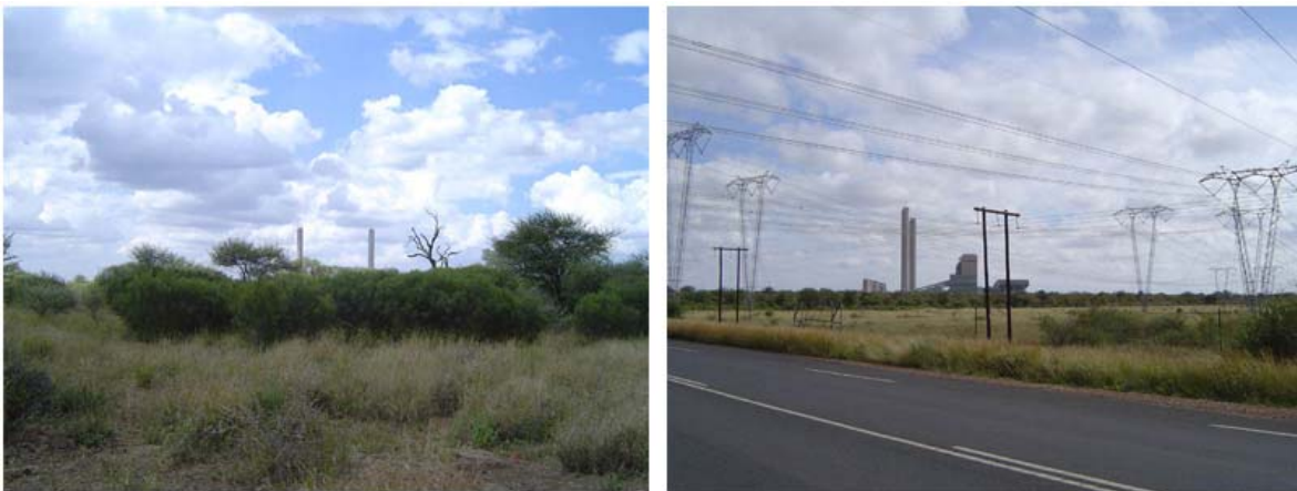
Figure 10.5: The presence of vegetation cover along the Stockpoort road near the Matimba power station, as apposed to the absence of vegetation at the Stockpoort/Steenbokpan road junction.

The Steenbokpan and Stockpoort roads are the two major secondary roads (higher viewer incidence) in the closest visual proximity of the proposed power station and associated infrastructure and will therefore account for the majority of short distance (0 - 3 km) visual impacts. Even here the visual absorption capacity of the natural vegetation has proven to be considerable in reducing and even negating the visual impact. Once again the areas with vegetation cover shielded the observer from the facility and oppositely, where the vegetation was removed or the observer was elevated above the trees and bushes, the facility became highly visible.