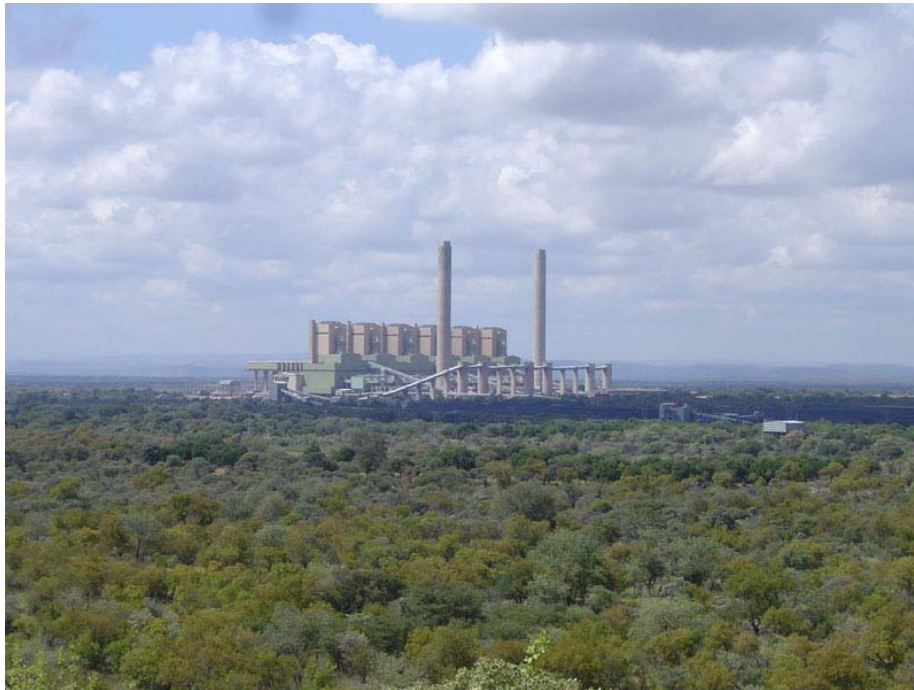
Figure 10.1: Matimba power station as seen from Nelson's Kop.